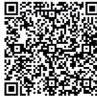
Figure 406. Link to NGA Nautical Calculators.

NGA's Maritime Safety Office website offers a variety of online Nautical Calculators for public use. These calculators solve many of the equations and conversions typically associated with marine navigation. See Figure 406.