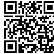
Figure 3600. NOAA's National Center for Environmental Information (NCEI) formerly the National Ocean Data Center (NODC).

General information on ocean currents is available from NOAA's National Center for Environmental Information (NCEI), formerly the National Ocean Data Center (NODC). See Figure 3600 for a link to the NCEI website.