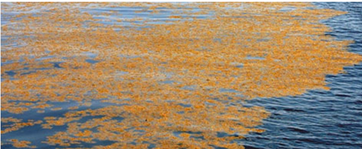
Figure 3606b. The Sargasso Sea, located entirely within the Atlantic Ocean, is the only sea without a land boundary.

The clockwise circulation of the North Atlantic leaves a large central area between the recirculation region and the Canary Current which has no well-defined currents. This area is known as the Sargasso Sea , from the large quantities of sargasso or gulfweed encountered there. See Figure 3606b.