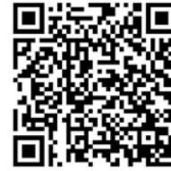
Figure 3102b. NGA- Radio Navigational Aids (Pub. No. 117).

For more detailed information on ice reporting consult Pub No. 117 Radio Navigation Aids , under Chapter 3 - Radio Navigational Warnings (section 300I: and section 300J: International Ice Warnings). See Figure 3102b for link.