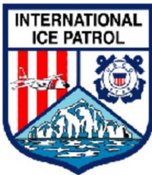
Figure 3102a. International Ice Patrol. http://www.navcen.uscg.gov/IIP .

Satellite telephone calls may be made to the International Ice Patrol Operations Center throughout the season at +1 860 271 2626 (toll free 877 423 7287, fax: 860 271 2773, email: iipcomms@uscg.mil ).