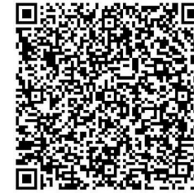
Figure 3121. U.S. National Search and Rescue Supplement to the IAMSAR.

The United States National Search and Rescue Supplement (NSS) to the IAMSAR manual provides guidance to all federal forces, military and civilian, that support civil search and rescue operations. The NSS is available online via the link from provided in Figure 3121.