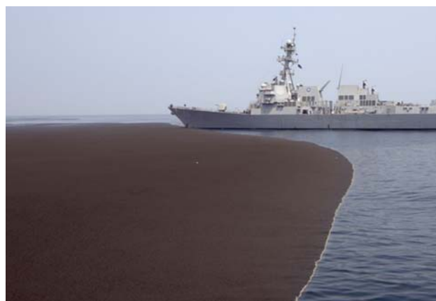
Figure 3102c. USS Bainbridge stopped near a pumice raft in the Red Sea.

In some cases, reports of discolored water at the sea surface have been investigated and found to be the result of newly-formed volcanic cones on the sea floor. These cones can grow rapidly and constitute a hazardous shoal in only a few years.