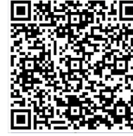
Figure 2705. Link to USCG list of courses search engine. http://www.dco.uscg.mil/Our-Organization/Assistant-Commandant-for-Prevention-Policy-CG-5P/National-Maritime-Center-NMC/Training-Assessments/

The International Maritime Organization's (IMO) In-